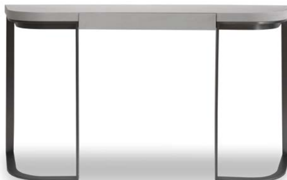
Kashmir Nuage b. brunita, burnished