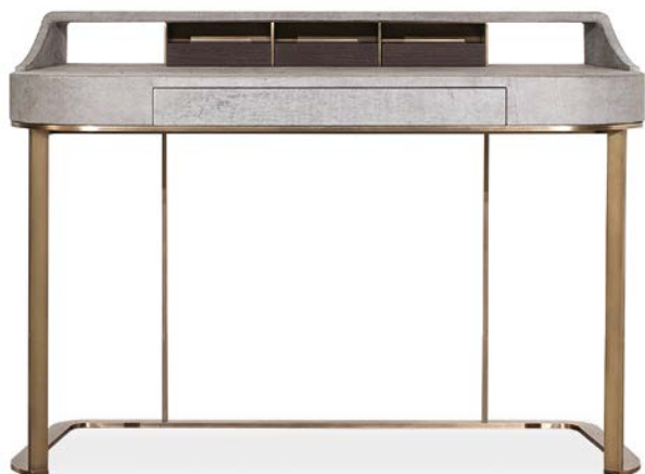
Bo.Hemian Siberia b. ottonata, brassed