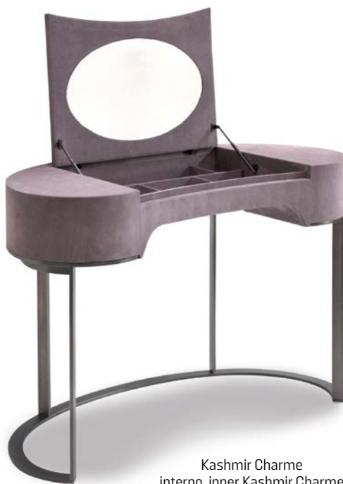
Kashmir Charme interno, inner Kashmir Charme b. brunita, burnished